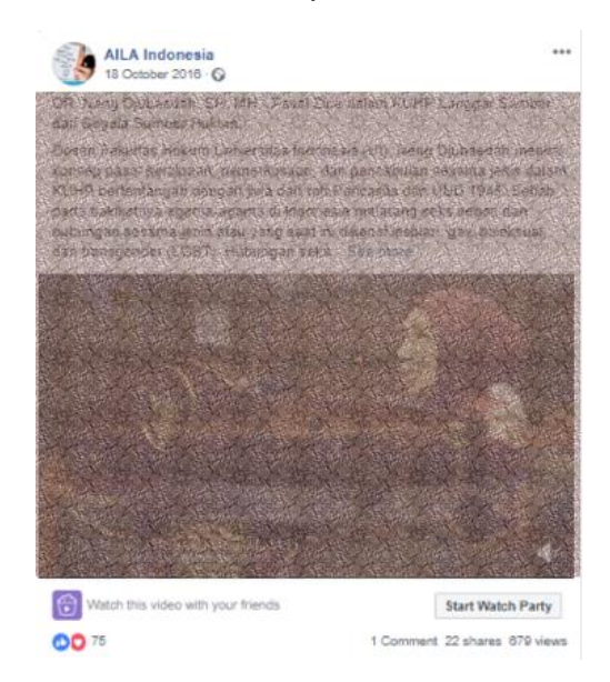
Figure 1. AILA Indonesia Facebook's post about adultery and homosexuality against religion and morality.

LGBTQ issues are addressed as "me vs. the other" by both sides even though they perform this differently. What is in common is that they both refer to the concept of LGBTQ as "the other". Examples are shown in figure 1 and 2, also in table 1 and 2.