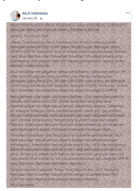
Figure 3. AILA Indonesia's post about public hearing session with the House of Representatives.

Nowadays, nationalism is considered to fade due to the many conflicts in Indonesia, one of which is the conflict in Papua. For this reason, many Indonesian people have re-echoed the nationalism issue. In this regard, nationalism issues is "me" because Indonesian people always call themselves as nationalist, for example, they are constantly using the phrase "NKRI harga mati" (Unitary State of the Republic of Indonesia is Undisputed), which means nationalism issues are part of Indonesian society. While, LGBTQ issues is "the others" because LGBTQ has been defined as something that came from the west because of globalization. For example, see figure 3 and 4, and also table 3 and 4.