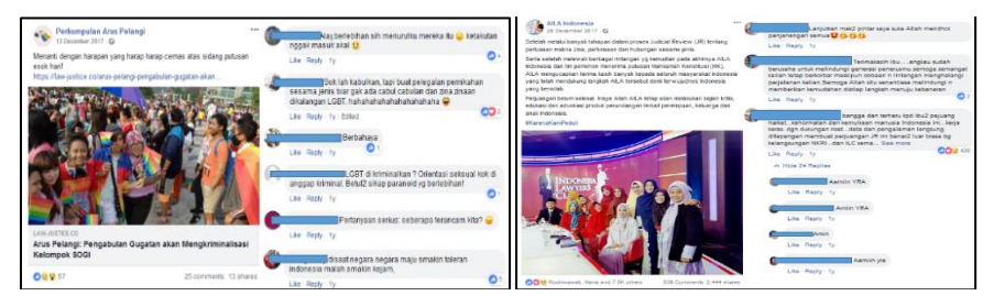
Figure 1. Perkumpulan Arus Pelangi and AILA Indonesia Facebook's post and discussions.

The figure shows on how different is the interaction patterns of both group when dealing with LGBQ issues. In their Facebook's post, Perkumpulan Arus Pelangi waited for the result of judicial review from Indonesia's constitutional court regarding to Draft of the Criminal Code. The draft is important because if it was legalized, LGBTQ could be criminalized. In the comment, some users questioned why sexual orientation is criminalized and thought that it is a paranoid attitude. In contrast to Perkumpulan Arus Pelangi is a post from AILA Indonesia . The figure shows that AILA Indonesia accepts the constitutional court's decision and is grateful for the support of all parties. They also stated that their fight is not over yet. The comment shows a lot of support and prayer for AILA. Their support was more based on the argument of sake of the next generation. Taking account on how the affordances are enacted differently, Perkumpulan Arus Pelangi using a website link as an addition to their post while AILA Indonesia using a photo and hashtag to give illustration to their post.