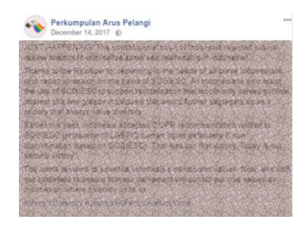
Figure 4. Perkumpulan Arus Pelangi's post about the rejection of judicial review.