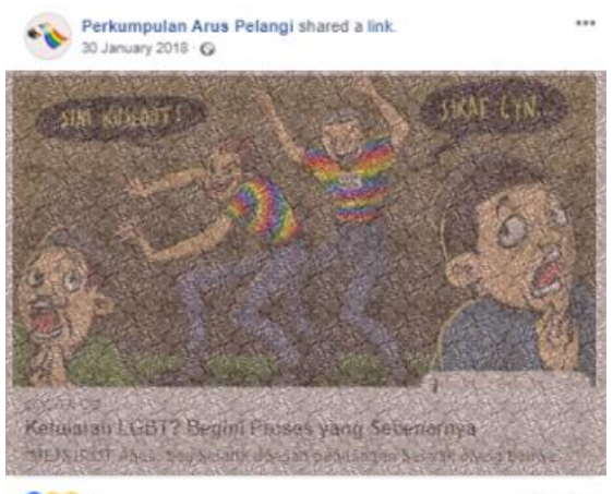
Figure 6. Perkumpulan Arus Pelangi posts link to counter many people who claim that LGBTQ is contagious.