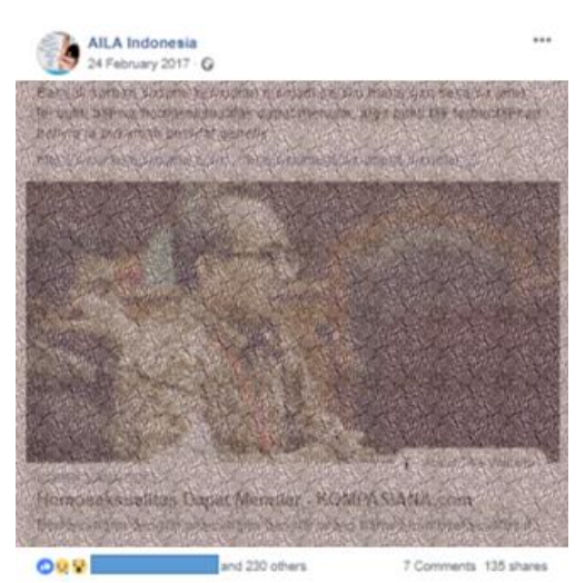
Table 5. Paraphrase and English translation of AILA Indonesia Facebook's post.