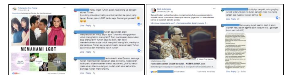
Figure 2. Perkumpulan Arus Pelangi and AILA Indonesia Facebook's post and comment section.

When discussing the LGBTQ issue, the different perspectives between Perkumpulan Arus Pelangi and AILA Indonesia as discussed on facebook pages can be explained as sociomaterial practices of both groups that are s constitutively entangled with the Facebook affordances. First, we can see it from the relationality practice that is being carried out. Relationality practice means online communities exist in relation to other assemblages. That is, within an online community, common interest unites agents, whereas across communities, differences in practices (such as participant needs) will create boundaries and potential conflict (Harris and Abedin, 2015). We can see the example in figures 2.